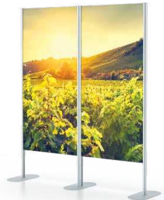
SKMM7-S Skyscraper Mount (side uprights) with a SKCU7-S Center Upright.