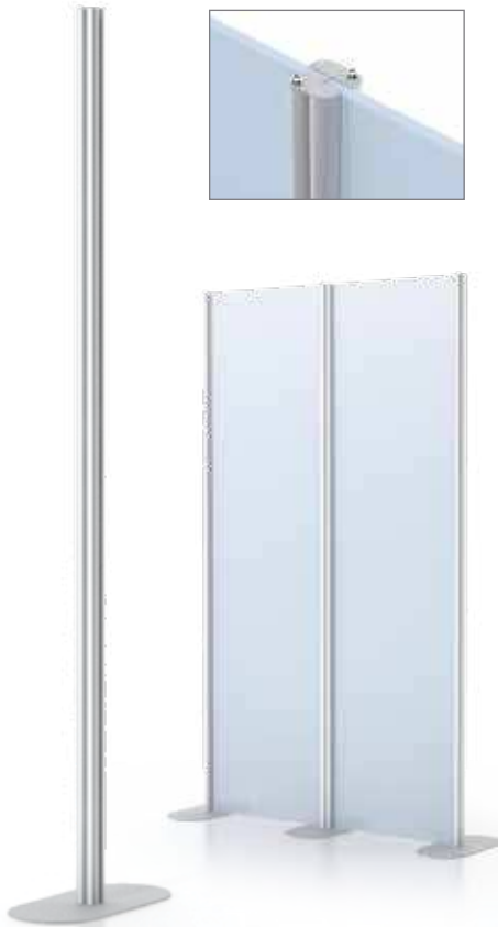
SKCU7-S Center Upright with oval base. Shown with SKMM7-S Skyscraper.