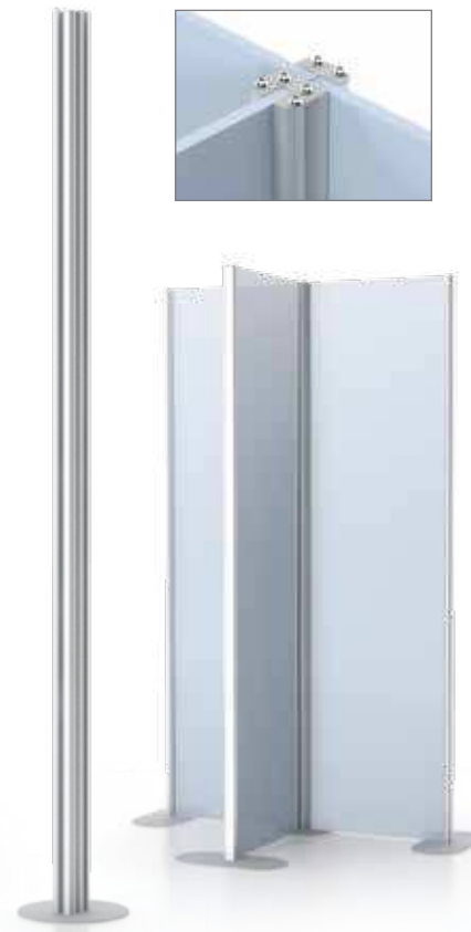
SKTU7-S "T" Assembly with round base. Shown with SKMM7-S and SKMS7-S .