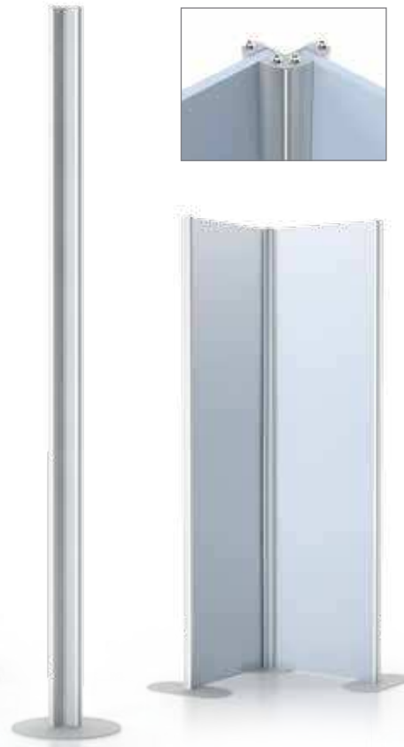
SKRA7-S Right Angle Assembly with round base. Shown with SKMM7-S Skyscraper.