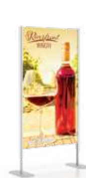
Graphics can be set anywhere along upright.

*Black units are more costly than silver.