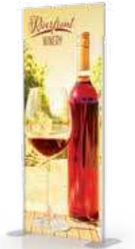
Graphics can extend above upright top.