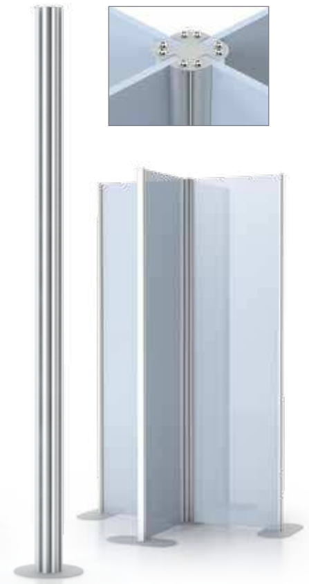
SKX7-S "Quad" Assembly with round base. Shown with (2) SKMM7-S Skyscrapers.